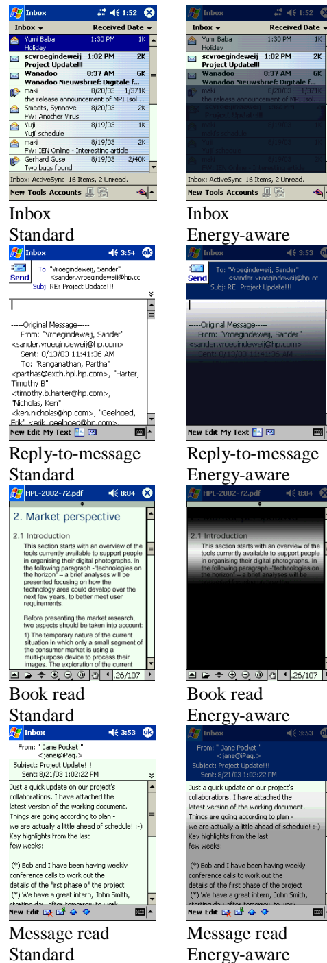
Figure 3: Screens with low ratings for energy-aware interfaces

Book-read: These screens simulated reading a book on a handheld via Adobe Acrobat reader. Overall, the energy-aware design of the Acrobat Reader Screen was rated low in quality and was unacceptable even after learning about its energy-saving benefits. Participants complained about not being able to read the entire text without scrolling. As shown in Table 2, the results indicate a statistically significant difference exists between the perceived quality of the standard design and the energy-aware design for contrast level and readability ( p = .00 for both). The energy-aware design received negative ratings for both contrast and readability while the standard design was rated more than three points higher for both. Acceptability ratings showed a similar trend and these ratings did not change after participants were made aware