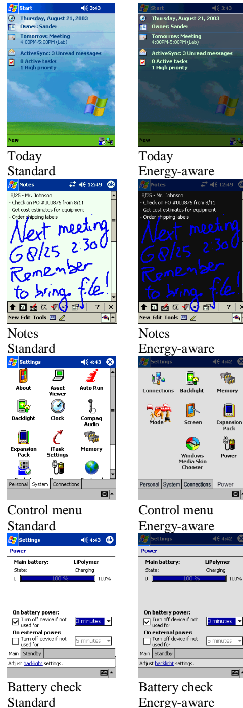
Figure 2: Screens with moderate ratings for the energy-aware interfaces

Scenarios involving (1) Inbox, (2) Reply-to-message, (3) Book-read, and (4) Message-read were generally rated lower for their energy-aware interface compared to their