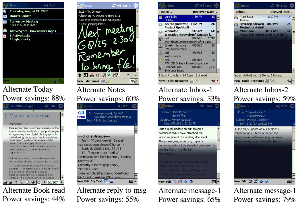
Figure 4: Screen shots of some qualitatively studied interfaces and their power savings over their corresponding standard interfaces

In some cases, users were willing to tradeoff some personal preferences for longer battery life. However, our results indicate that the common themes that emerged from our study about user preferences can be leveraged for better interfaces with greater acceptance and energy