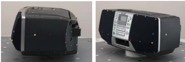
Figure 1. Two images of a boombox.

We have run a comparison between the standard deviation consistency check and our histogram consistency check. For this comparison, we have used images collected of a boombox object sitting on a rotating table. Nine images of the object were collected. Eight were every 45 degrees around the object and one was looking straight down. Figure 1 shows two example images from this dataset.