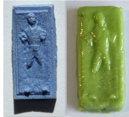
Figure 5: On the left, the sample is made from particles with an average diameter of 700 nm. On the right, the average particle size was 50 µm. Both samples were fired following the same firing schedule.

order of a micron in size, which leads to the opaque appearance. This assumption will be further investigated.