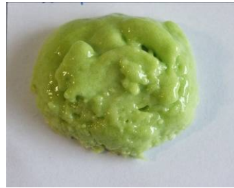
Figure 1: Glass sample with sodium silicate solution as the index matching fluid. Firing of the sample leads to bubbling and loss of all detail.

a solution of for example sodium silicate or liquid glass shows reduced scattering. But pastes made like that are not printable. Under pressure, the solution is squeezed out of the paste and jamming occurs. This is a well-known phenomenon easily observed when walking on wet sand on the beach. Firing causes gas formation even with well dried green ware which leads to bubbling of the sample and loss of all detail as shown in figure 1.