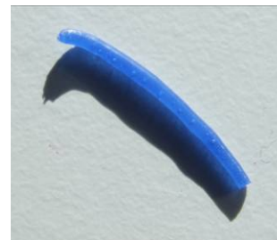
Figure 2: Transparent glass sample with air inclusions.

Scattering has only little influence on the transmitted light when the diameter of the scatterer is either bigger than \sim 20 \mu\text{m} or smaller than 400 \text{ nm} , independent of the refractive index difference between scatterer and surrounding medium (see for example [1]). We have found that glass frit with particle sizes between 38 \mu\text{m} and 75 \mu\text{m} results in transparent samples with