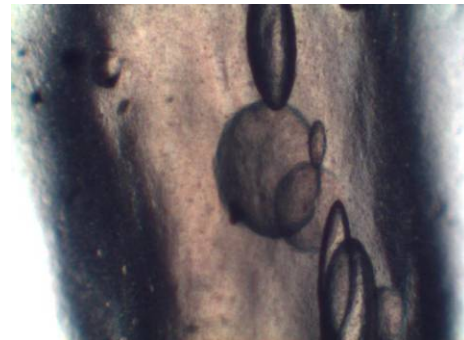
Figure 6: Micrograph of a translucent polymer string with 60wt% glass loading. Glass index and polymer index are matched. The glass particles are not visible but scattering is caused by air inclusions clearly visible as round and elongated bubbles.

Cold glass stands for all materials where glass is used in a strengthening component in another cured matrix. The weight percentage of the glass component is only between 5 and 20 wt% and curing does not rely on fusing of the glass particle. First experiments show that the toughness and elasticity of natural polymers change with the amount of added glass frit. A low weight percentage of glass reduces shrinkage but the mechanical characteristics of the sample after drying are governed by those of the polymer. The sample becomes tougher but more brittle with increasing glass content. Beyond 50wt% of glass we find a decline in elastic strength. The elasticity of the polymer makes it possible to apply the glass polymer film on elastic substrates. The best results achieved so far are with materials with an index matched to the glass particles. Index matching helps particle dispersion and suppresses scattering independent of particle size.