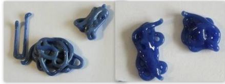
Figure 3: For glass sample on the left 40wt% of saccharides were used as binder, for the one on the right only 5wt%. The left one is discoloured, the right one not.

40wt% of polysaccharides to the glass water mixture. Polysaccharides caramelize at temperatures between 110°C and 180°. Above 250°C caramel decomposes into carbon mon- and di-oxide, hydrocarbons, alcohols, aldehydes, ketones and several furan derivatives which are volatile [3]. If the caramel is trapped inside the sample, this decomposition is incomplete and leads to a discolouration of the sample (see figure 3). The polysaccharide content has to be reduced drastically to avoid this effect.