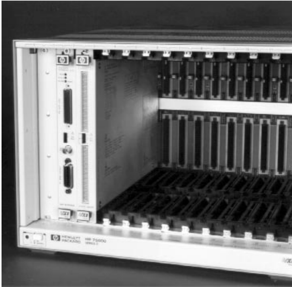
Fig. 1. The HP HD2000 data acquisition system showing the HP E1413 and HP E1414 modules.

requirements without requiring large additional development time and cost.