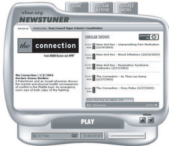
Figure 1: The News Tuner interface.

In this paper, we describe a new web audio player interface that provides efficient access to archived material. This player, called the News Tuner (see figure 1), combines live broadcasts, archived audio, chat, and studio cameras into a single application. Its simple and intuitive user interface is designed for browsing and searching large recordings of topical spoken-word audio. It takes advantage of semantic similarities among news items to suggest potential related stories to the listener. It does this without the need of selecting or entering any queries. The user is only asked to click a potential story.