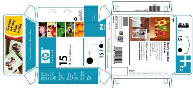
Figure 5. Sample product packaging (retired product packaging from the author’s company) suitable for supporting a plurality of inks for enabling distinct (hybrid) workflows. The whitespace above the “15” and the light blue spot color near the “hp” Logo are suitable for overprinting with UV and IR inks. MICR printing can be used over the white areas. Several different (1D, 2D and 2D color or 3D) types of bar code are shown.

Another modality is conductivity. Conductive inks [22], for example, can be used for connecting printed sensors and electronic components, for printing RFID antenna, and for wiring of tamper-evident circuits in smart packaging.