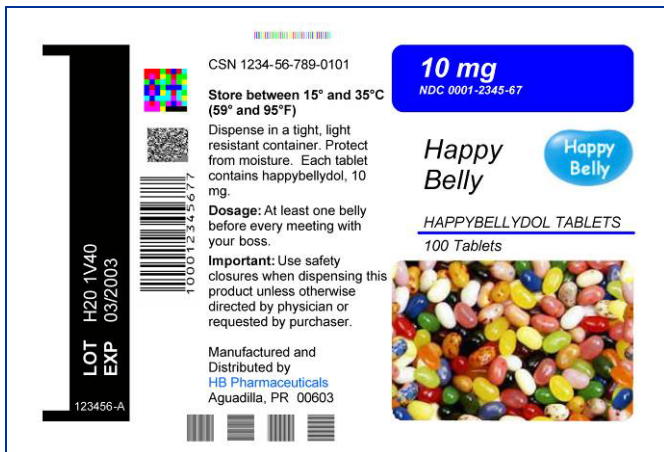
Figure 2. Example of hybrid package consisting of variable data 2D and 3D barcodes (upper near left), and a variable digital watermark embedded in the image of the jelly beans in the lower right.

Hybrid packages can also consist of multiple VDP approaches being deployed simultaneously. In Figure 2, VDP is used to produce a variable 3D color barcode, a variable 2D barcode, and a variable digital watermark in the image of the jelly beans.