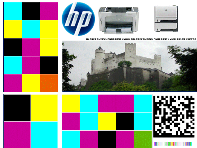
Figure 3. Print-print hybrid packaging. The original size of the “medallion” is approximately 1.5 x 1.0 cm. The colored tiles in the upper left and lower center can be read by mobile cameras, while the tiles in the lower left are used for color calibration. A 2D bar code and set of color bars are in the lower right. In the center and right center, the image of the castle contains a digital watermark. At the top center and right, the brand mark and product pictures are used for product identification. Beneath these images there is variable-data printed microtext, which is not readable after copying.

In Figure 2, two different variably-printed elements are hybridized onto a single package. This approach is termed print-print hybrid packaging . The VDP generated elements can be independent of each other or related to each other (e.g. through hashing, digital signing, etc.). There is considerable effort by the GS1 and other global standards bodies to provide multiple barcodes as one means of print-print hybridization on packages and labels. As the GS1 states [13], “This Work Group is dedicated to assessing the impact of the move toward placing multiple bar codes on one end-user package. Work Group members will identify the problems and their potential solutions, to support FMCG [Fast-Moving Consumer Goods], Healthcare, internal, and mobile commerce applications, and then standardize those solutions. One key goal is to make it obvious to consumers, end users, and caregivers which bar code on the package is ‘their’ bar code, and to make it obvious to machines which bar code is ‘their’ bar code.” This is an important goal. When a single bar code is present, then there is only one expected service to be provided. However, when two or more barcodes are present (such as in Figure 2), there must also be a means to disambiguate the plurality of services.