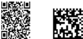
Figure 4. Example of two different 2D bar codes. On the left is a QR Code bar code, and on the right is a Data Matrix bar code.

Beneath these branding and product identification images there is variable-data printed microtext, which is not readable after copying. The microtext content can also be compared to the decoded content of one or more of the other variable marks. Also at the microtext size scale, in the lower right is a set of small color bars, which can be used for additional authentication.